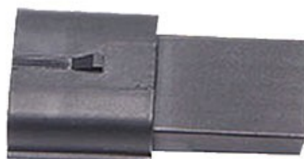
Second generation (2014-2015)