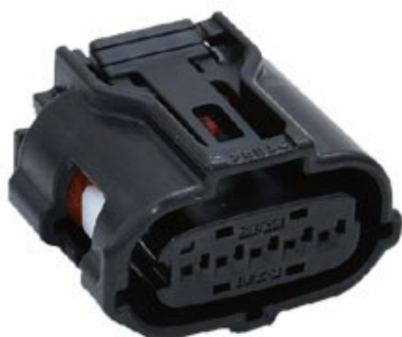
First generation (2006-2013)

We keep moving on devote ourselves to development and innovaton !