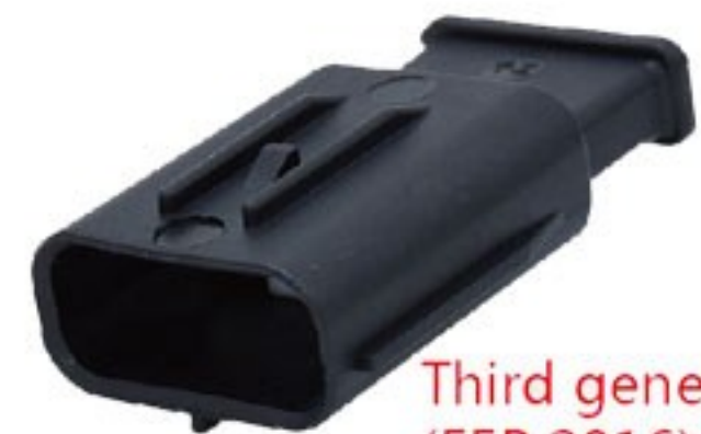
Third generation (FEB.2016)